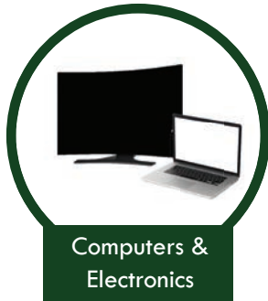
Computers & Electronics