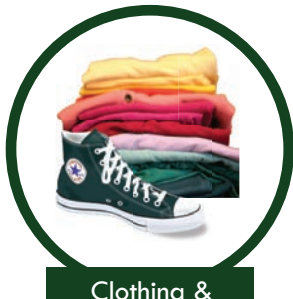
Clothing & Shoes