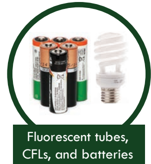
Fluorescent tubes, CFLs, and batteries