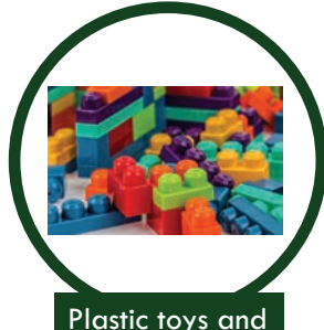
Plastic toys and play structures

For Recycling: No appliances that contain freon.