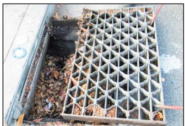
City workers prevent flooding by cleaning leaves and other debris from catch basins before the rain starts.

When a storm is forecast, a team of City engineers and maintenance staff proactively clean drains and perform other preventative maintenance before the rain starts. Once the storm arrives, this team patrols known problem areas, making sure inlets and catch basins are clear, and taking other action as necessary to prevent flooding. They also respond to calls from the public as needed.