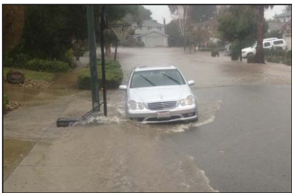
Flooded streets make it hard for cars, pedestrians, bikes, and emergency vehicles to navigate.

The City of Cupertino recently completed a comprehensive Storm Drain Master Plan (led by Schaaf and Wheeler Civil Engineers) which determined the appropriate service levels for operations and maintenance for the City’s storm drainage system, and it identified several high priority system deficiencies, including undersized pipes. As a result, the City of Cupertino is considering proposing a funding measure to help pay for these critical infrastructure needs, and seeks input from local property owners on your priorities for local flood protection and clean water projects. Please read the following information, then complete the enclosed survey and mail it back in the postage paid envelope as soon as possible. Your answers will help guide our efforts toward protecting the City and its residents from local flooding and protecting water quality.