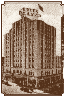
Hotel De Anza in San Jose, built in 1931