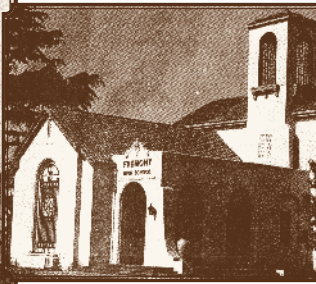
Fremont High School, built in 1926