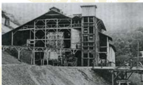
Quicksilver furnaces at New Almaden, circa 1880s

So how do the California Gold Rush and the New Almaden Quicksilver mine connect to the U.S. Civil War which raged on the other side of the continent? The gold and silver from the mines in California and Nevada helped finance the Union side in the war in the 1860's. However, there were many Confederate sympathizers out West as well. Leaders for both the Union and the Confederacy wanted these two western states in their respective