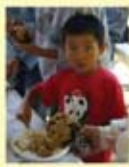
Nature Arts and Crafts!