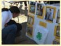
Environmental Groups from around the Bay Area!

For details call (408) 252-3740 or visit www.scvas.org