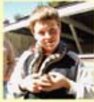
Live Animals - Birds of Prey, Snakes, Insects, and more!