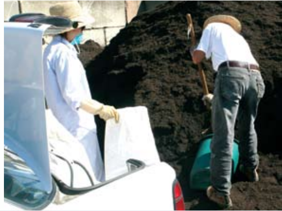
Cupertino Compost Site

cation Program at 408.918.4640 for details or email: compost@pln.sccgov.org .