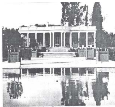
Le Petit Trianon The House From The Pool

try estate in addition to homes up the Peninsula. He bought 137 acres of land - where De Anza College stands now and commissioned architect Willis Polk to build a winery and estate, part of which is still in use today by the college. In the late 1800's, the social activities of the upper crust re-