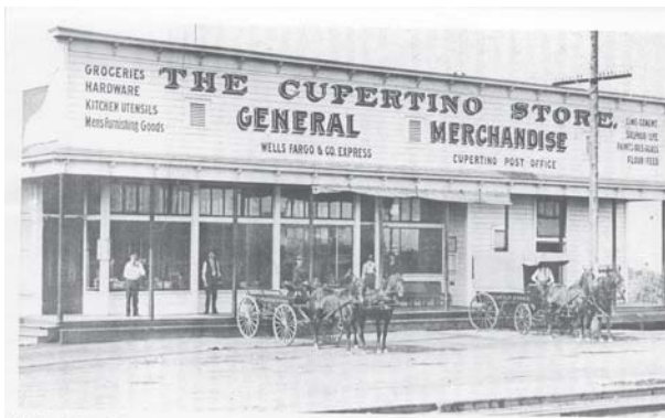
By 1904, the Cupertino Store Inc., located at The Crossroads where the Gulf Station is today, became the largest general store in the Valley, east of San Jose. Note the Interurban railway tracks in the foreground.