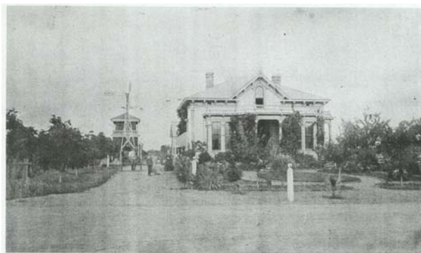
Captain Merithew's home and "Prospect Vineyard" included fifty acres on McClellan Road, Cupertino, located on portions of today's De Anza College campus site. (Danbar Collection)

olved around grand estates in the Burlingame, Menlo area, where the rich and famous amused themselves with golf, horseback riding, racing, fox hunting and polo. When Baldwin built his "Beaulieu" estate, architect Polk designed a "le Petit Trianon" modeled after "Le Grand Trianon" at Versailles, a 17th century French Pavilion. Baldwin's estate had the many outbuildings necessary to the winery operation and