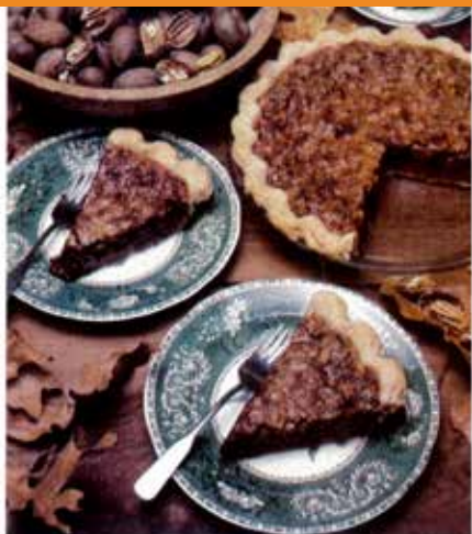
Bourbon Chocolate Pecan Pie: They don't come much richer.

The following recipe with yummy picture is shared for your eating pleasure.