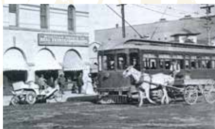
Main Street Los Gatos horseless carriage trolley, horse and wagon.

There were competing rail companies and lines all over the valley. You could catch the Peninsular Electric Railway in San Jose - go all the way down Stevens Creek Road, turn right at old Monta Vista and head over to Palo Alto or Redwood City to catch the train to San Francisco. Or you could start in San Jose and go to Campbell, Saratoga, Los Gatos and Congress Springs on the western side of the valley - on the Blossom Line - to enjoy the miles of orchards in bloom in the spring.