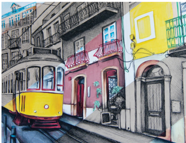
Art by Apoorva Talwalkar