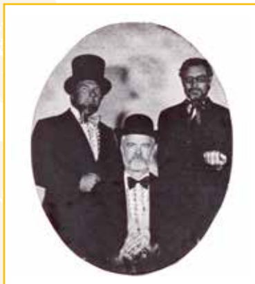
City Council, 1970

April 1974 find the City Council granting a permit for a hot air balloon exhibit, featuring free rides to the public. The article says, " Being on familiar ground, the council refused to get up in the air over the matter and the permit breezed to an easy 5 - 0 victory. Council members have been offered the first rides (any comments