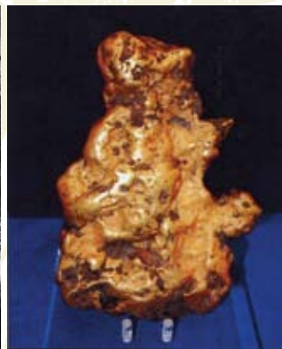
Found in 2010, a 98.6 oz. (troy weight) gold nugget in Nevada County

naturally occurring in the California Gold Country. Claims, counter-claims and accusations of fraud abounded on both sides. The controversial nugget was re-examined and it was determined that the nugget actually was Australian in origin.