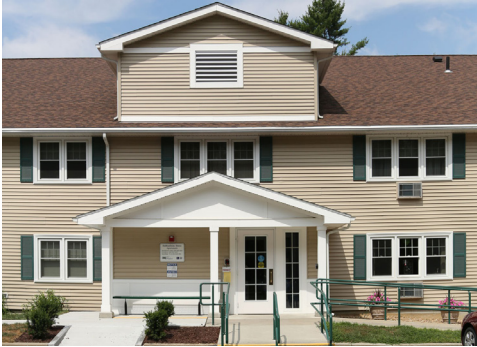
Development of housing for persons with special needs is a priority for Cupertino

BMR units, if the developer: 1) enters into an agreement limiting rents in exchange for a financial contribution or a type of assistance specified in density bonus law (which includes a variety of regulatory relief); and 2) provides very low-income and low-income BMR rental units.