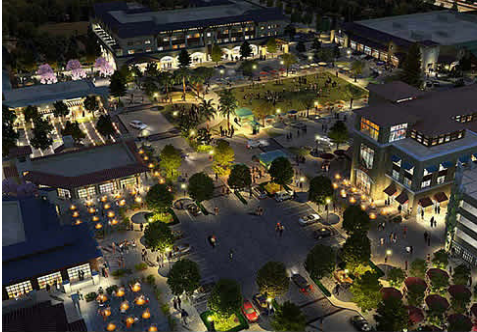
Cupertino will encourage the development of mixed-use centers

Strategy 3: Lot Consolidation. To facilitate residential and mixed use developments, the City will continue to: