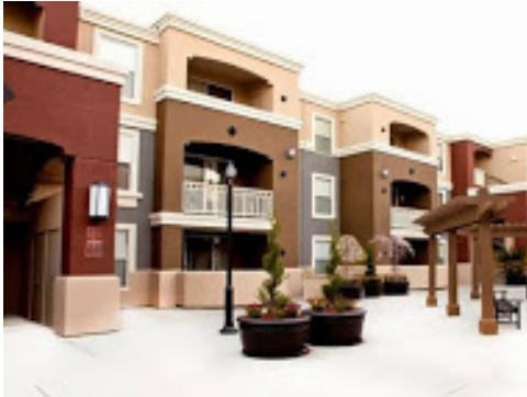
Cupertino’s Below Market Rate Affordable Housing Fund will continue to support affordable housing projects, programs, and services