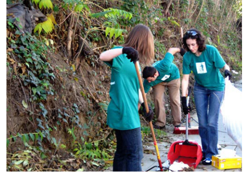
Community clean up campaigns will continue to be sponsored for both public and private properties

To further the objectives of the Green Building Ordinance, the City will evaluate the potential to provide incentives, such as waiving or reducing fees, for energy conservation improvements at affordable housing projects (existing or new) with fewer than ten units to exceed the minimum requirements of the California Green Building Code. This City will also implement the policies in its climate action plan to achieve residential-focused greenhouse gas emission reductions and further these community energy and water conservation goals