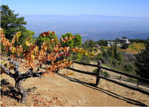
The City of Cupertino permits farmworker housing in agricultural districts