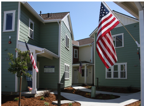
A range of housing options should be encouraged in the community

Maintain and/or adopt appropriate land use regulations and other development tools to encourage the development of affordable housing. Make every reasonable effort to disperse units throughout the community but not at the expense of undermining the fundamental goal of providing affordable units.