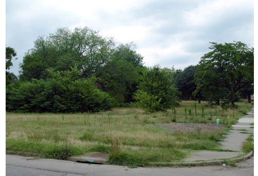
Lot consolidation will continue to be encouraged for development