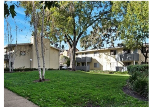
Low income households may require specific housing solutions due to a greater risk for issues such as homelessness

each locality’s share of regional housing need (RHNA). In conjunction with the State mandated housing element update cycle that requires Bay Area jurisdictions to update their elements by January 31, 2015, ABAG has determined housing unit production needs for each jurisdiction within the Bay Area. These allocations set housing production goals for the planning period that runs from January 1, 2014 through October 31, 2022 (Table HE-4).