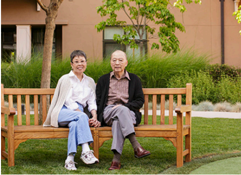
Cupertino's elderly renter households are more likely to be lower income than elderly owner households