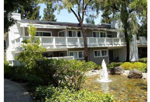
The Housing Element should identify land at appropriate densities to accommodate the Regional Housing Needs Allocation (RHNA)

Strategy 5: Heart of the City Specific Plan. To reduce constraints to housing development, and in order to ensure that the designated sites can obtain the realistic capacity shown in the Housing Element, the City will review revisions to the Heart of the City Specific Plan residential density calculation requirement, to eliminate the requirement to net the non-residential portion of the development from the lot area.