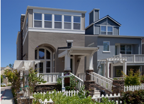
Family households are the largest proportions of household type in Cupertino

Non-family households include persons who live alone or in groups of unrelated individuals. Cupertino has a large proportion of family households. In 2011, family households comprised 77 percent of all households in the City, compared with 71 percent of Santa Clara County households (see Table HE-1).