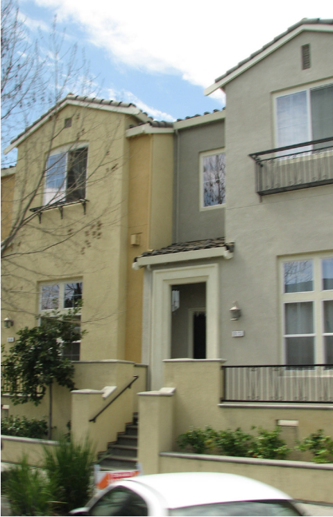
The Housing Needs Assessment establishes the framework for defining the City's housing goals and needs