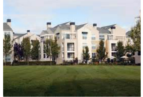
The Housing Plan should encourage a diverse stock of housing types

To ensure the mitigation fees continue to be adequate to mitigate the impacts of new development on affordable housing needs, the City will update its Nexus Study for the Housing Mitigation Plan by the end of 2015.