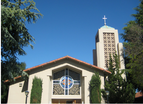
A 2010 zoning amendment allows for emergency shelters as a matter of right in the Quasi-Public zoning district