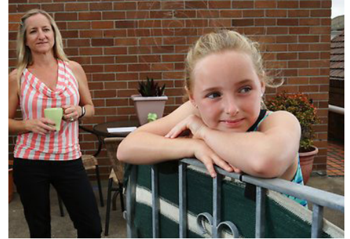
In 2010, a significant proportion of Cupertino's 3.3 percent female-headed single-parent households were living in poverty

A disability is a physical or mental impairment that limits one or more major life activities. Persons with disabilities generally have lower incomes and often face barriers to finding employment or adequate housing due to physical or structural obstacles. This segment of the population often needs affordable housing that is located near public transportation, services, and shopping. Persons with disabilities may require units equipped with wheelchair accessibility or other special features that accommodate physical or sensory limitations. Depending on the severity of the disability, people may live independently with some assistance in their own homes, or may require assisted living and supportive services in special care facilities. Approximately six percent of Cupertino residents and eight percent of Santa Clara County residents had one or more disabilities in 2010.