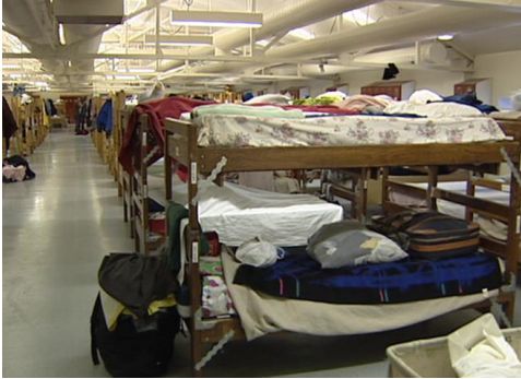
Shelters across Santa Clara county provide for thousands of homeless people and families seeking assistance