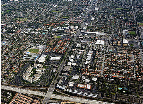
The population of Cupertino is expected to increase by twenty-two percent over the next thirty years