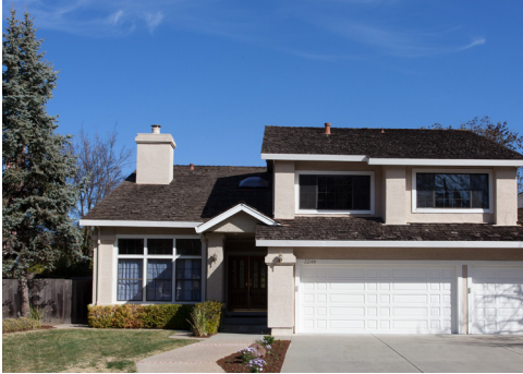
The Association of Bay Area Governments (ABAG) helps determine each area's share of the regional housing need

credits, the City has a remaining RHNA of 1,002 units: 356 extremely low/very low-income units, 207 low-income units, 196 moderate-income units, and 243 above moderate-income units.