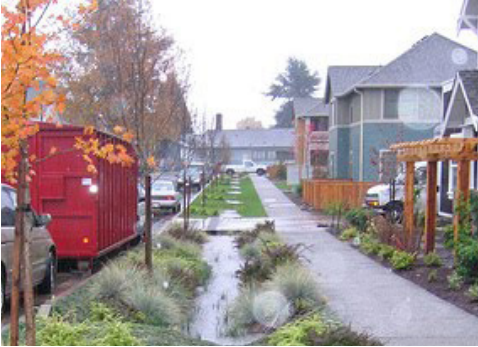
The City's Landscape Ordinance will continue to be implemented for water conservation