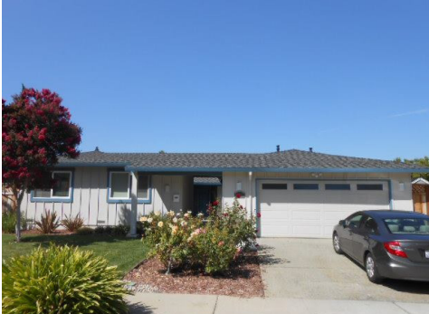
The City will use BMR AHF and CDBG to support residential rehabilitation throughout Cupertino

The City will continue to monitor its entire portfolio of affordable housing for-sale and rental inventory annually. The City will monitor its affordable for-sale inventory by requiring Below Market-Rate (BMR) homeowners to submit proof of occupancy such as utility bills, mortgage loan documentation, homeowner’s insurance, and property tax bills. The City will further monitor its affordable for-sale inventory by ordering title company lot books, reviewing property profile reports and updating its public database annually. The City will monitor its affordable rental inventory by verifying proof of occupancy and performing annual rental income certifications for each BMR tenant. The City records a Resale Restriction Agreement against each affordable BMR for-sale unit and a Regulatory Agreement for BMR rental units to help ensure long-term affordability. To help further preserve the City’s affordable housing stock, the City may consider providing assistance to rehabilitate and upgrade the affordable units as well.