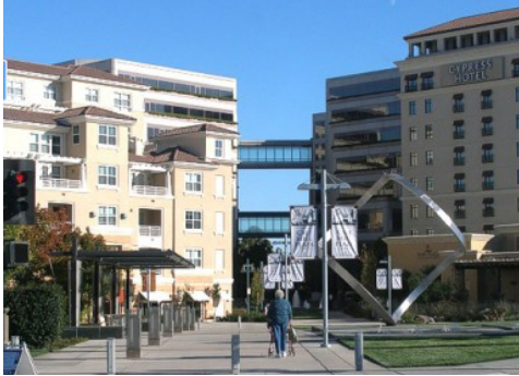
The City will monitor its portfolio of affordable for-sale and rental housing annually