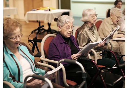
The City will continue to encourage the development of low income housing for communities with special needs, such as the elderly