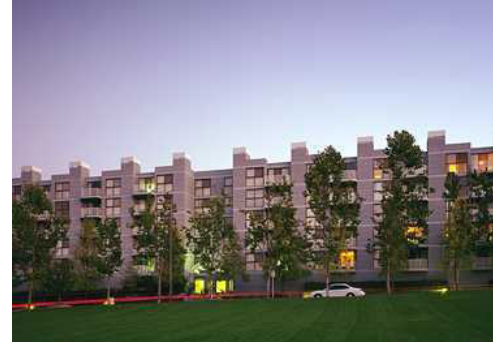
The Bay Area technology boom has increased housing demand at all levels

The cost of housing is dependent on a variety of factors, including underlying land costs, market characteristics, and financing options. In the Bay Area, the technology boom has increased the demand for new housing at all income levels, resulting in both lower-earning residents and well-paid area professionals competing for housing in an overcrowded and expensive market. High housing costs can price lower-income families out of the market, cause extreme cost burdens, or force households into overcrowded conditions. Cupertino has some of the highest housing costs in the region.