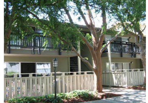
The City will continue to monitor housing that is considered at risk for converting to market-rate housing

Strategy 18: Housing Preservation Program. When a proposed development or redevelopment of a site would cause a loss of multi-family housing, the City will grant approval only if: