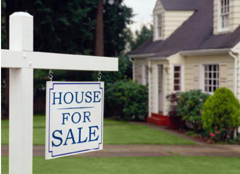
Despite the national economic downturn, Cupertino home values have continued to rise