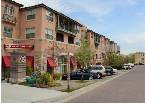
The City's Below Market Rate Residential Mitigation Program requires all new residential developers to either provide below market rate units or pay a mitigation fee