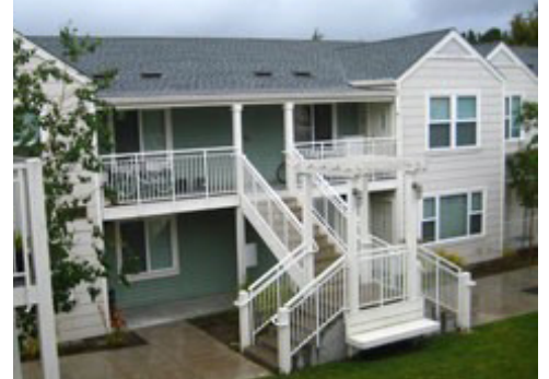
The City will update its Nexus Study for the Housing Mitigation Plan by the end of 2015

Strategy 10: Surplus Properties for Housing. The City will explore opportunities on surplus properties as follows: