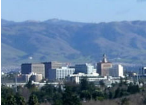
Cupertino has historically had more jobs than housing

One particular site will involve substantial coordination for redevelopment (Vallco Shopping District, Site A2). Due to the magnitude of the project, the City has established a contingency plan to meet the RHNA if a Specific Plan is not approved within three years of Housing Element adoption. This contingency plan (called Scenario B and discussed further in General Plan Appendix B), would involve the City removing Vallco Shopping District, adding more priority sites to the inventory, and also increasing the density/ allowable units on other priority sites.