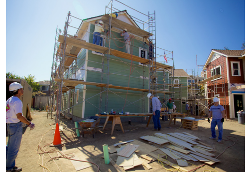
Affordable housing development will continue to be incentivized by the City

The City will update the density bonus ordinance as necessary to respond to future changes in State law.