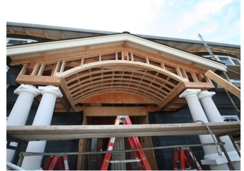
The City shall continue to support the rehabilitation of very low, low, and moderate income housing