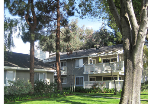
The City will continue to provide Fair Housing services for all residents of Cupertino

Strategy 24: Rotating Homeless Shelter. The City will continue to support the operation of a Rotating Homeless Shelter program.