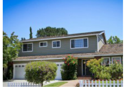
The City's population increase has placed new pressures on Cupertino's neighborhoods

Households are divided into two different types, depending on their composition. Family households are those consisting of two or more related persons living together.