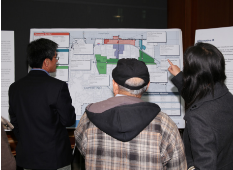
The City's Density Bonus Ordinance will be updated to respond to changes in the law