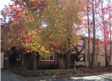
The City will continue work to eliminate unlawful housing discrimination

These may include, but are not limited to, the following: