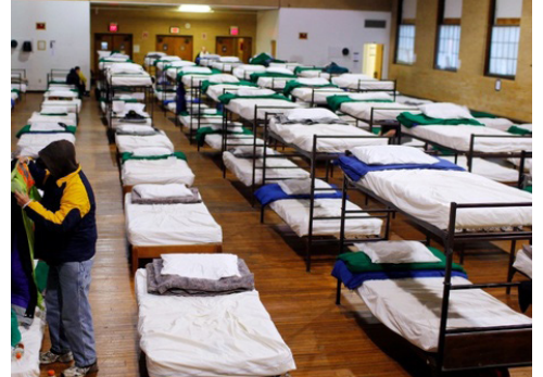
The City shall continue to support the operation of rotating homeless shelters

Strategy 26: Coordination with Outside Agencies and Organizations. The City recognizes the importance of partnering with outside agencies and organizations in addressing local and regional housing issues.