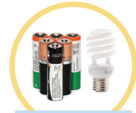
Light bulbs & batteries

Batteries and bulbs can be disposed of at some hardware stores or at the Santa Clara County Household Hazardous Waste Program listed above.