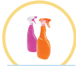
Cleaners & Chemicals

Schedule a free drop-off appointment at HHW.org or (408) 299-7300