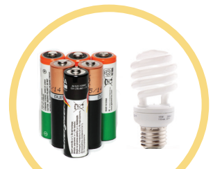
Fluorescent tubes, CFLs, & batteries