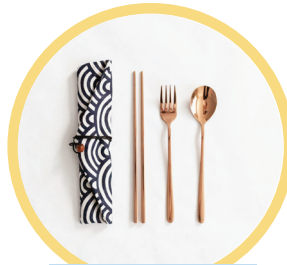
Reusable utensil kit

Search online for stores that allow you to bring your own containers for bulk products