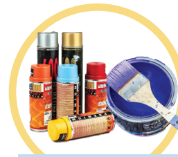
Spray cans & paint