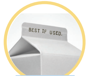
Best If Used