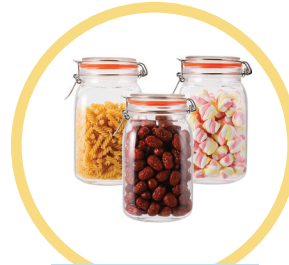
Bulk dry food