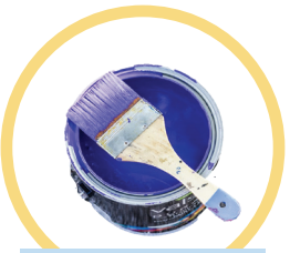
Paint, primers, stains, & sealers

Visit paintcare.org to find a free drop-off location