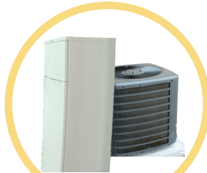
Refrigerators, Air Conditioners, & Other Appliances