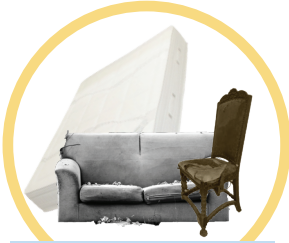
Worn & Damaged Furniture

Visit recology.com/cupertino for full list of accepted items.