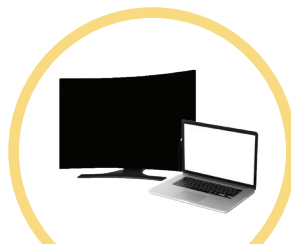
Computers & Electronics