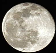
Tonight's Full Moon is Called as Full Snow Moon.