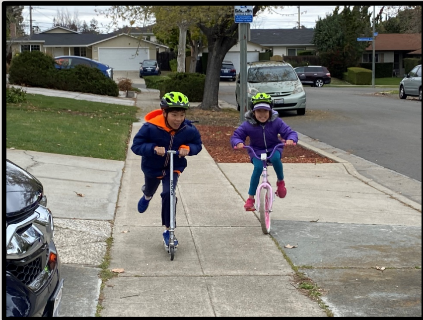
Bike to the Parks