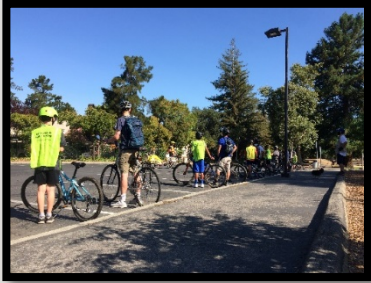
Socially Distant Middle School Bike Skills Workshop