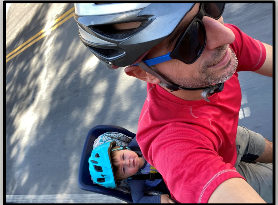
Bike to the Parks