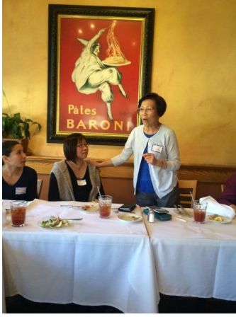
March Mixer at Fontana's Italian

Office of Economic Development | City of Cupertino | 408.777.7607 | econdev@cupertino.org | www.InBusinessCupertino.com