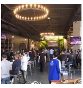
Coconut's Fish Cafe